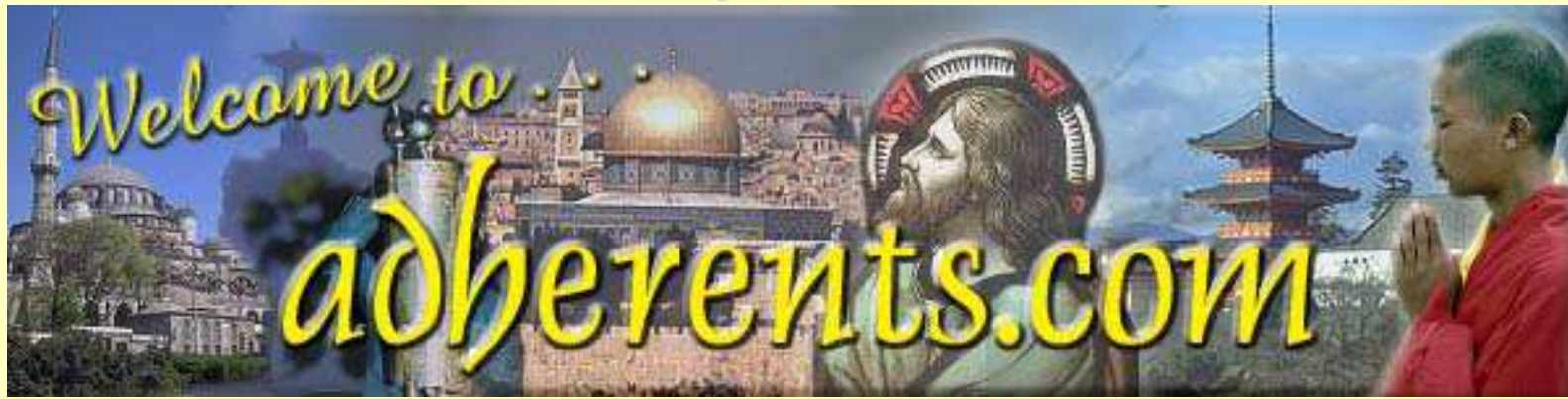
Logo by Richard Satterfield

Adherents.com is a growing collection of over 62,000 adherent statistics and religious geography citations -- references to published membership/adherent statistics and congregation statistics for over 4,200 religions , churches, denominations, religious bodies, faith groups, tribes, cultures, movements, ultimate concerns, etc.