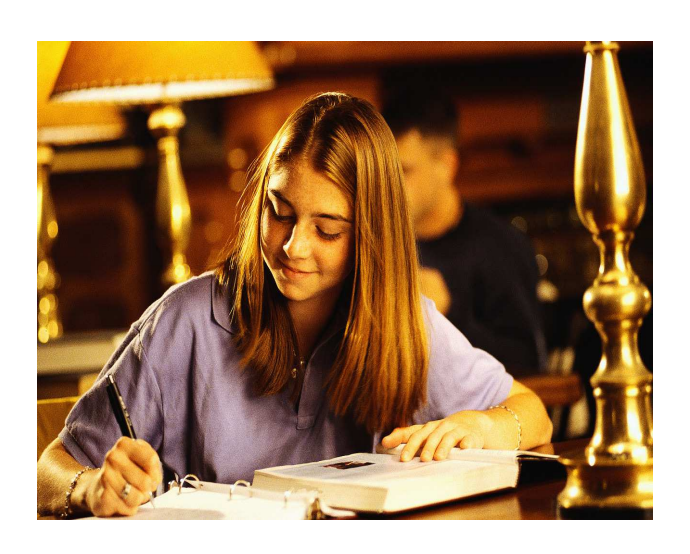
"Veterans Working for Veterans