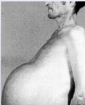
Patient with marked ascites.

Substantial evidence exists to support the concept that kidney failure in hepatorenal syndrome is not related to structural damage and is instead functional in nature. For example, almost 30 years ago, Koppel and colleagues (1969) demonstrated that kidneys transplanted from patients with hepatorenal syndrome are capable of re-