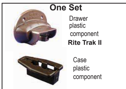
Rite Trak II (Oval drawer plastic)